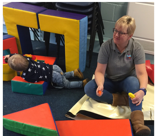
Peterborough and District Deaf Children's Society